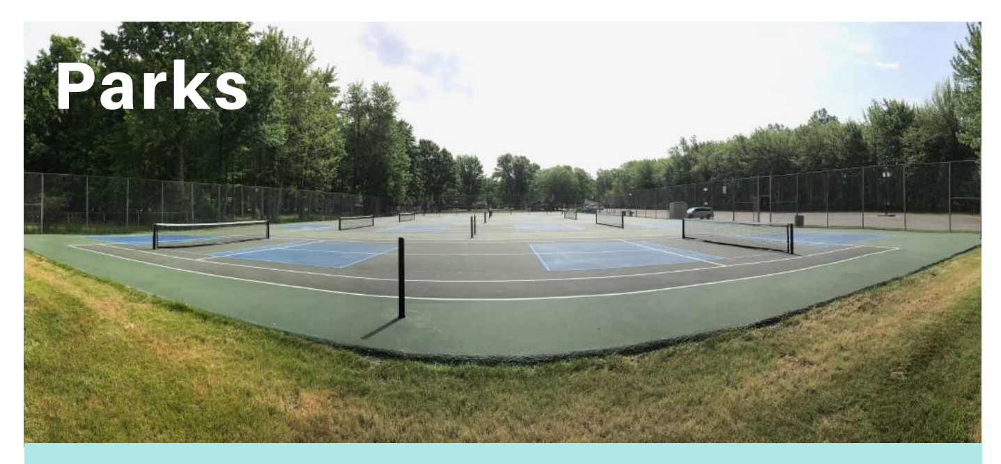
Newly renovated tennis courts at South Central Park. Courts serve pickleball & tennis enthusiasts.